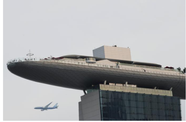
Boeing 787 Dreamliner cruises by Sands SkyPark

This special viewing is made possible by Boeing's 787 Dream Tour, which is making two stops in Asia this month to showcase the game-changing technologies of the new plane.